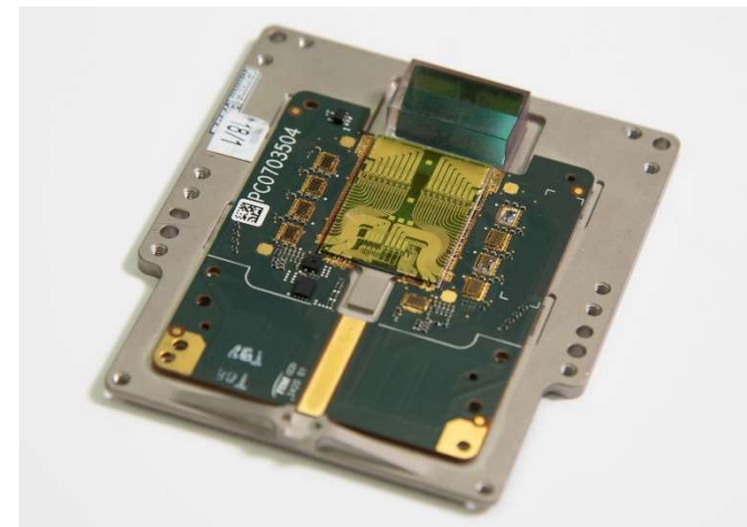
PIC for FMCW-Lidar presented by intel and mobileye in 2021. [2]